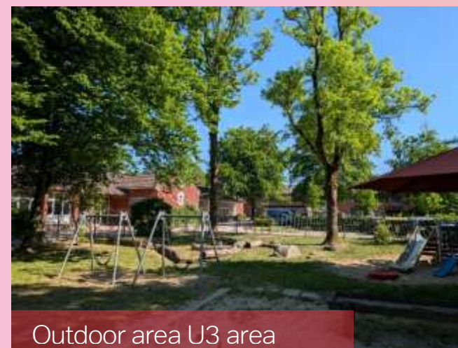
Outdoor area U3 area