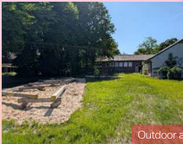
Outdoor area School